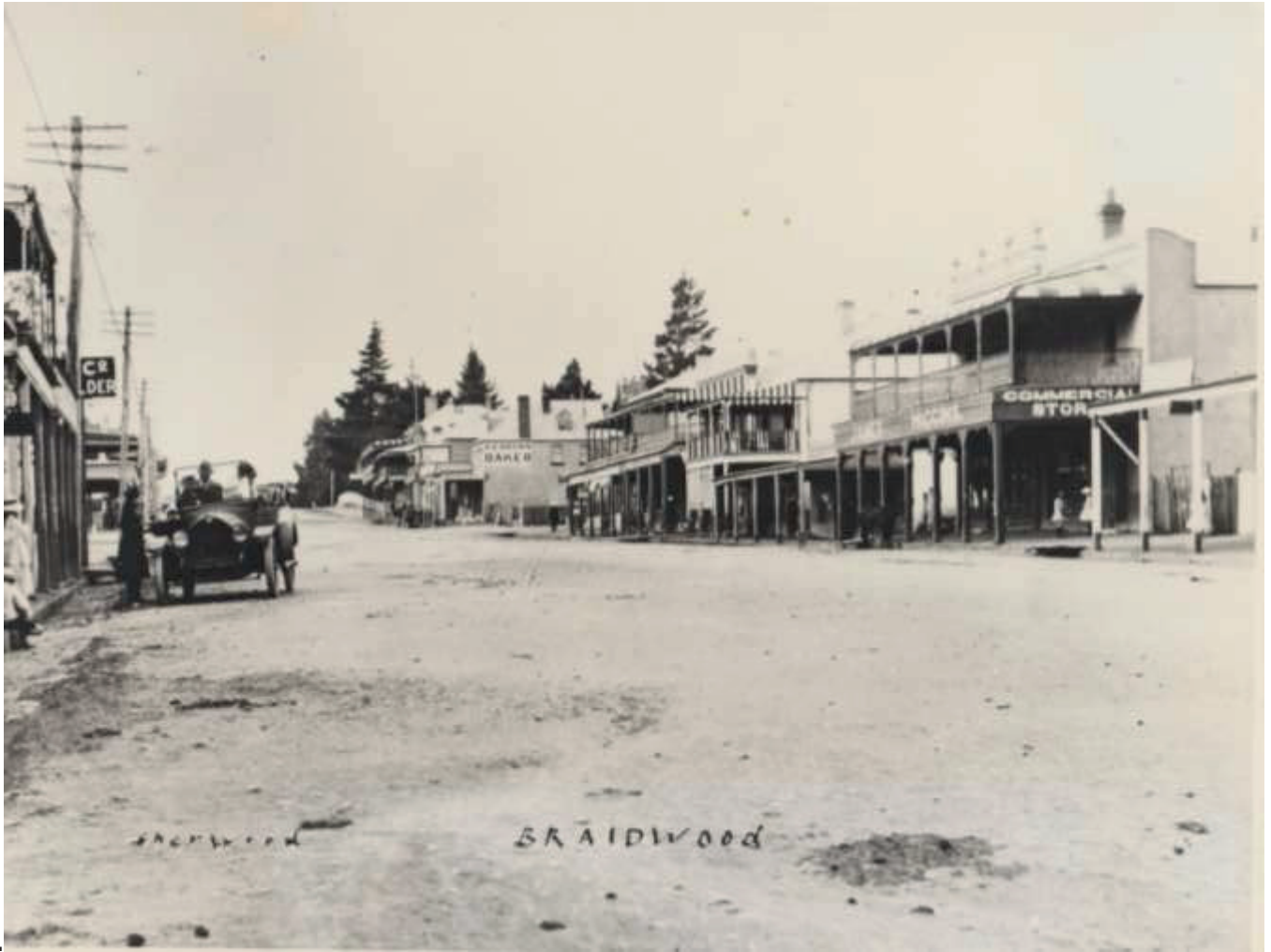
Looking up Wallace Street, Braidwood, early 1900's.