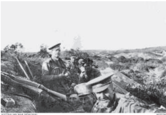
Members of 13th Battalion, AIF, occupying Quinn's Post on the heights above Anzac Cove.

The 4th Brigade landed at ANZAC Cove late in the afternoon of 25 April 1915. From May to August, the battalion was heavily involved in establishing and defending the ANZAC front line. In August, the 4th Brigade attacked Hill 971. The hill was taken at great cost, although Turkish reinforcements forced the Australians to withdraw. The 13th also suffered casualties during the attack on Hill 60 on 27 August. The battalion served at ANZAC until the evacuation in December.