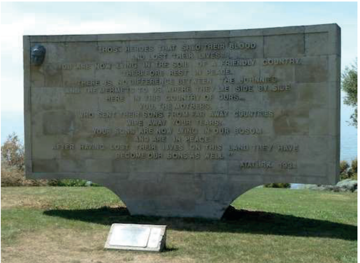
Ataturk quote at Anzac Cove.