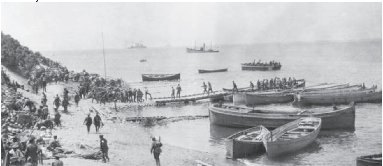
Ottoman Empire: Turkey, Dardanelles, Gallipoli, Anzac Area (Gallipoli), Anzac Beach looking south, Clearing Station (Lieutenant Colonel Giblin) within the first days of the landing at Anzac Cove.