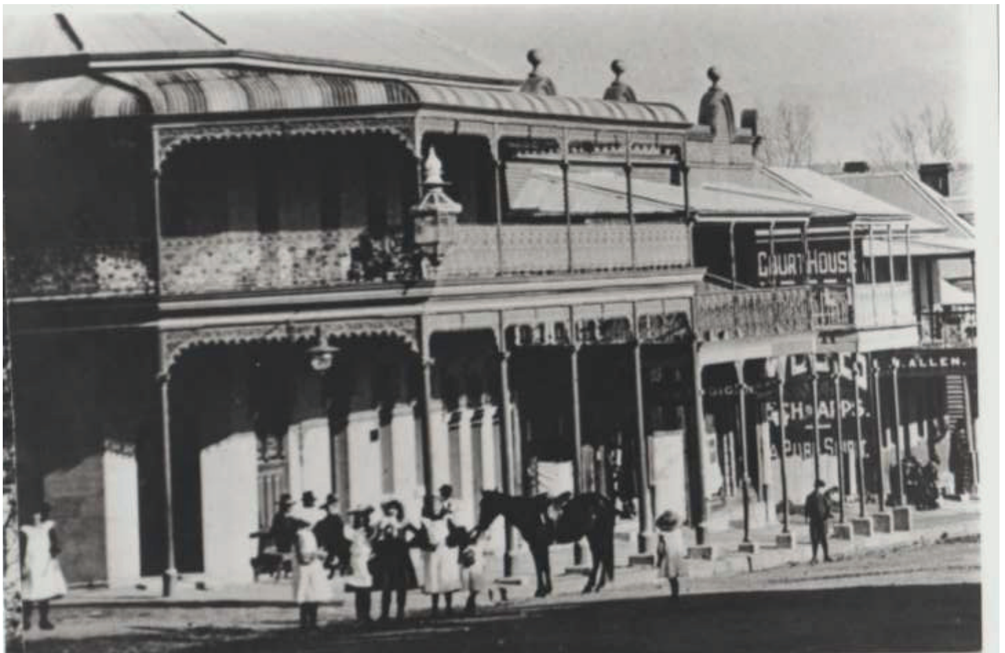
A peaceful afternoon scene in Wallace Street, Braidwood, early 1900s.