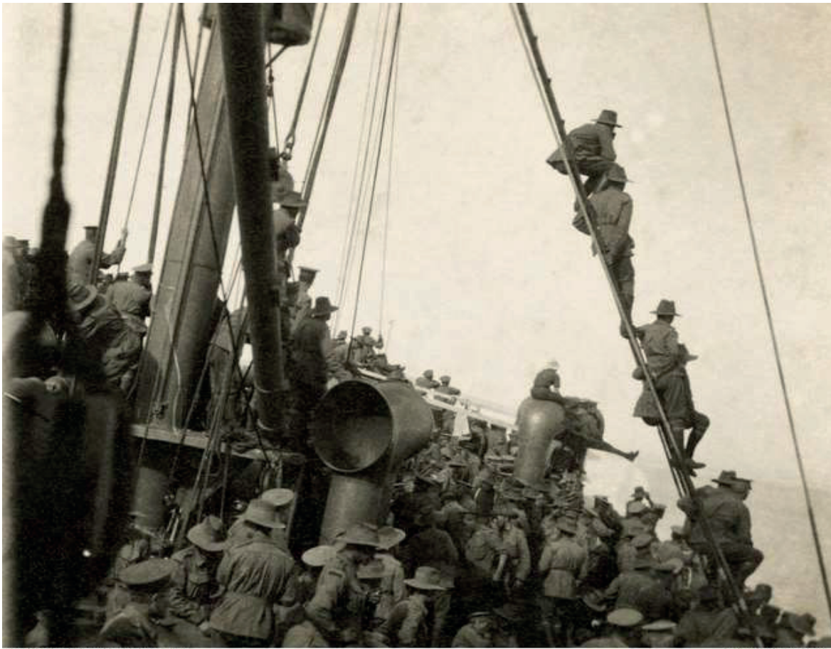
At Sea, 25 April 1915: Troops on the deck of HMT Ascot (A33) watching the bombardment whilst being transported to Anzac Cove on 25 April 1915. Note: the photograph was not properly exposed resulting in loss of image on the left of the print.