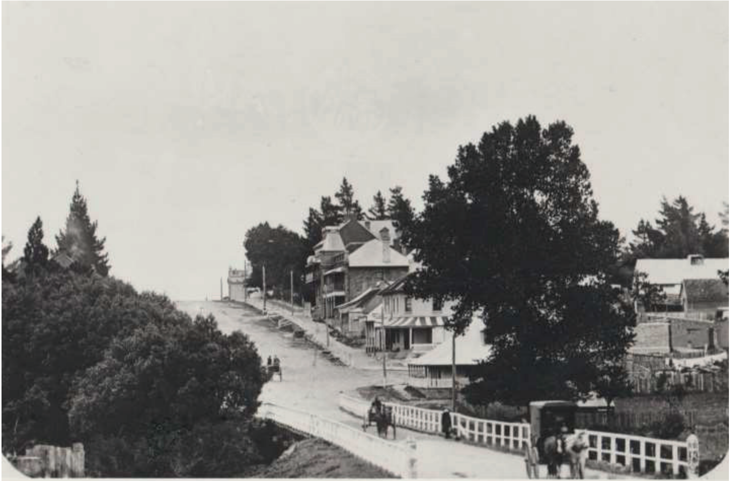
Wallace Street, Braidwood, early 1900s.