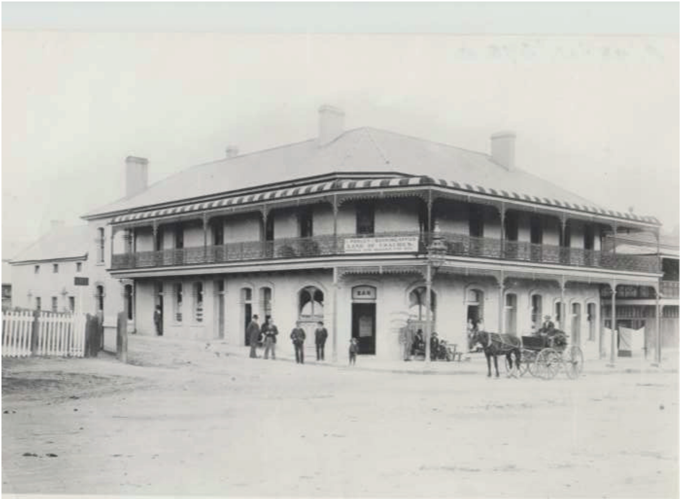
The Royal Mail Hotel, Wallace Street, Braidwood.