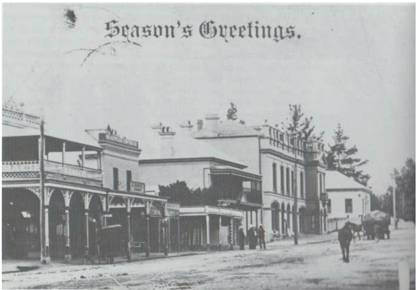
Wallace Street, Braidwood 1903. From Braidwood Dear Braidwood by Netta Ellis