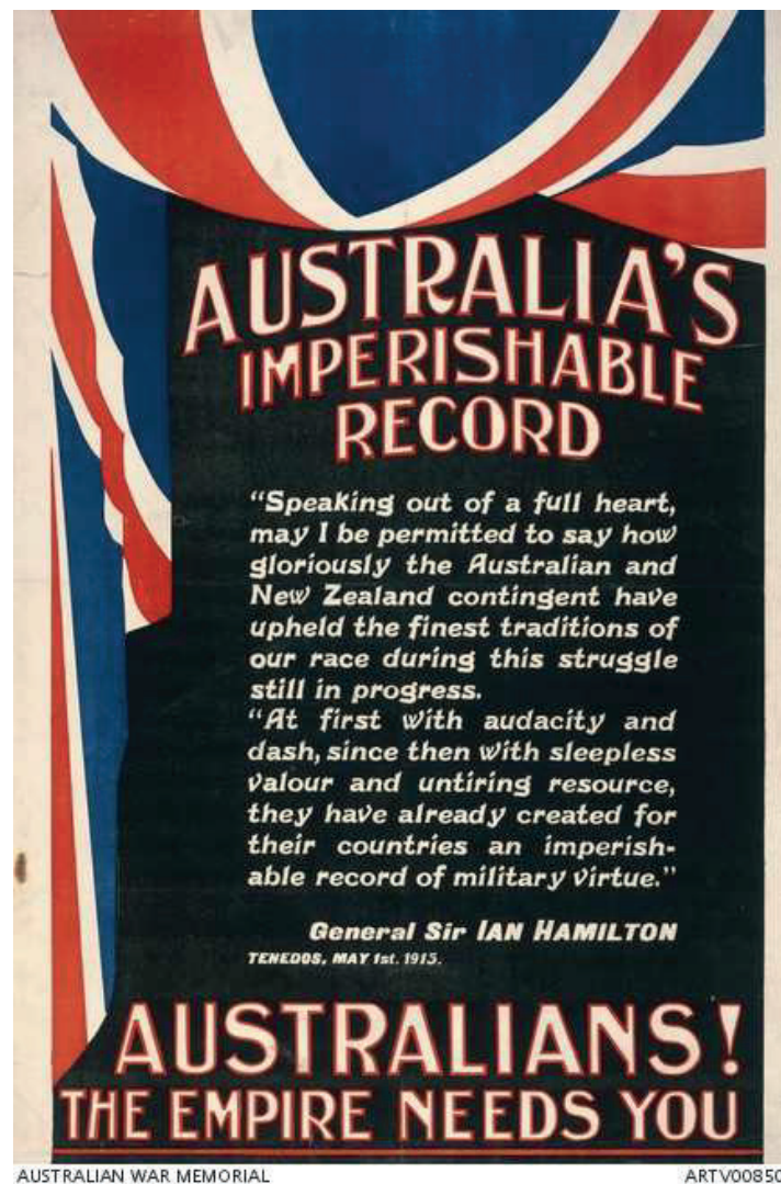
Australian War Memorial ARTV00850 Australian First World War recruitment poster. It frames part of a speech given by British General Sir Ian Hamilton at Tenedos, May 1st. 1915.