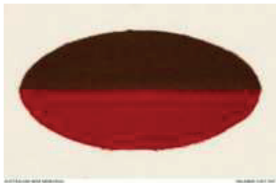
39 th Colour Patch

The 39th Battalion was formed on 21 February 1916 at the Ballarat Showgrounds in Victoria and drew most of its recruits from the state's Western District. It became part of the 10th Brigade of the 3rd Australian Division. Sailing from Melbourne on 27 May, the battalion arrived in Britain on 18 July and commenced four months of training. It crossed to France in late November and moved into the trenches of the Western Front for the first time on 9 December, just in time for the onset of the terrible winter of 1916-17.