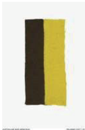
31 st Colour Patch

The 31st Battalion was raised as part of the 8th Brigade at Enoggera, on the outskirts of Brisbane, in August 1915. Some of the battalion's companies, however, were also raised at Broadmeadows Camp in Victoria. In early October, these two elements were united at Broadmeadows, and the battalion sailed from Melbourne the following month.