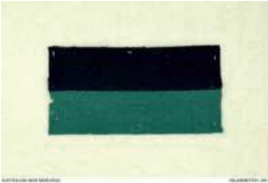
1 st Battalion Colour Patch

The 1st Battalion was the first infantry unit recruited for the AIF in New South Wales during the First World War.