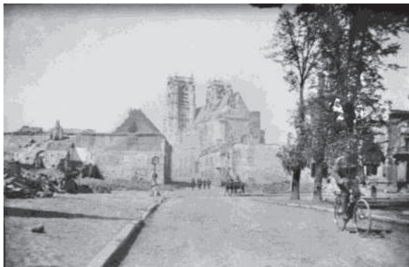
Corbie, France. 1918. The remains of buildings on the streets of Corbie. The roof of the Cathedral has been damaged. The Allies often used Corbie as a resting point after battle. A soldier on a bicycle is on the right.

The 53rd Battalion entered its last major battle of the war on 29 September 1918. This operation was mounted by the 5th and 3rd Australian Divisions, in co-operation with American forces, to break through the formidable German defences along the St Quentin Canal. The battalion withdrew to rest on 2 October and was still doing so when the war ended. The progressive return of troops to Australia for discharge resulted in the 53rd merging with the 55th Battalion on 10 March 1919. The combined 53/55th Battalion, in turn, disbanded on 11 April.