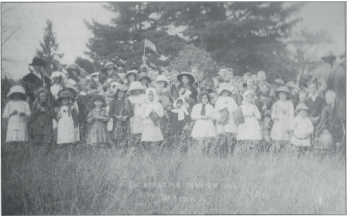
Celebrating Belgian Day, Ryrie Park, Braidwood, 14 th May 1915.

While most of us associate Australia Day with 26 January, in 1915 that date was celebrated as Foundation Day and only in New South Wales, as each of the colonies had their own commemorations for their founding. During the First World War, the concept of a national 'Australia Day' was instead part of a wider fundraising plan where money was raised by declaring a special 'day' on which events such as auctions, stalls, performances and street collections were held to encourage the community to contribute to the war effort. Belgian Day, for example, held on 14 May 1915, was one of the first of these occasions. (Australian War Memorial.)