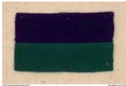
Colour Patch 2 nd Battalion

The 2nd Battalion was among the first infantry units raised for the AIF during the First World War. Like the 1st, 3rd and 4th Battalions it was recruited from New South Wales and, together with these battalions, formed the 1st Brigade.