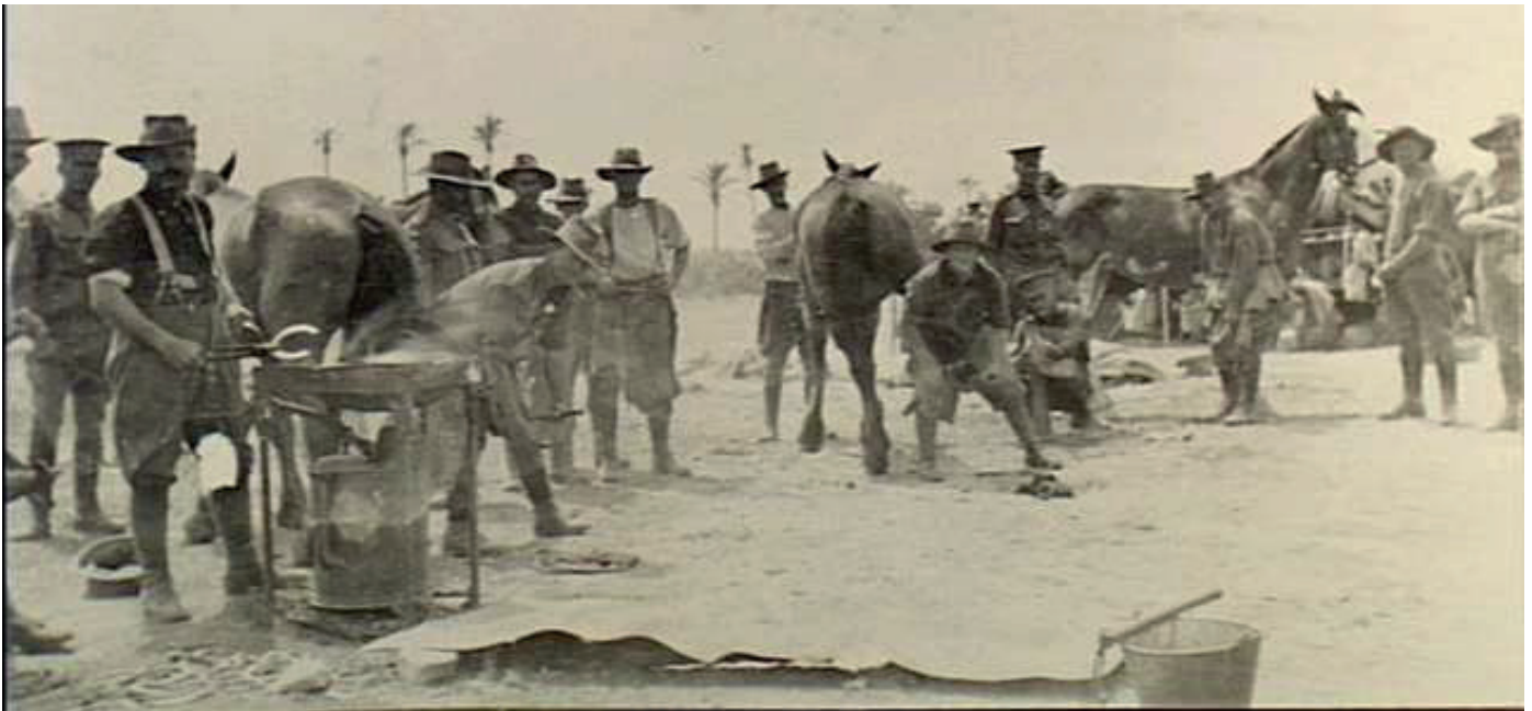
Mena, Egypt: Australian soldiers hot-shoeing their horses in the field. At a portable anvil (left), a blacksmith is hammering into shape a red-hot horseshoe that he is holding with a pair of tongs in his other hand. The smith has heated the horseshoe in a brazier filled with hot coals or charcoal which is directly beneath the anvil. Scattered at his feet are many more horseshoes which he will heat and shape.