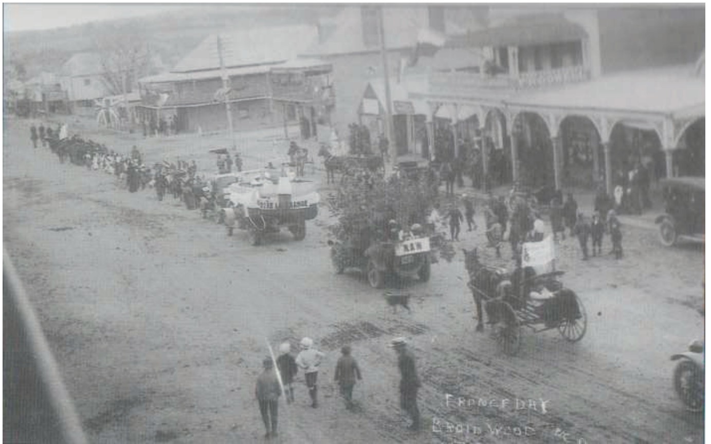
France Day, Wallace Street Braidwood (Photo: Braidwood Letters from the Front, by Roslyn Maddrell). Story from the The Braidwood Review and District Advocate, Tuesday 16 July 1918, page 2